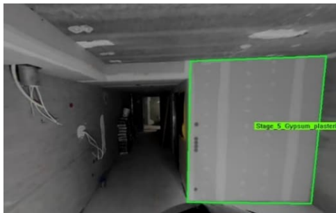
Figure 3: Stage 6: Plastering of the wall

In the following experiments we use pre-trained YOLO v7 deep neural network model commonly used for fast, real-time object detection. It was first introduced by Redmon et. al. (2016) to modify object detection as a regression problem to spatially separated bounding boxes