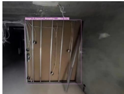
Figure 7: Prediction for Electrical wiring stage

In future works, we will explore how data from different sensors like location, temperature, humidity, and videos/images can be fused together for workflow monitoring. This is envisaged to be done by using a real time data collection and identification system involving Spot robot and algorithm developed for the use case. The Spot robot will collect videos and point cloud data of the site and these along with other sensor data will be