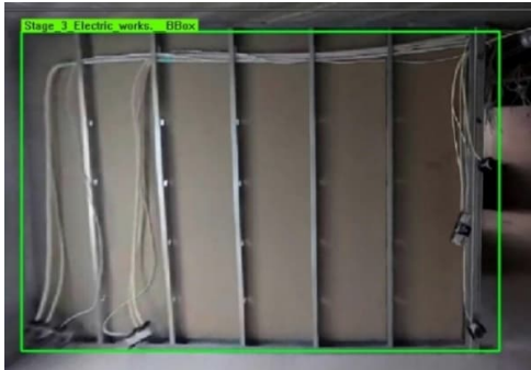
Figure 2: Stage 3-Electrical and plumbing works