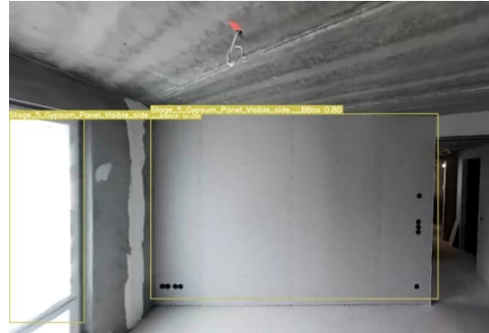
Figure 5: Prediction for Visible side Gypsum Paneling

worksite. It can also be explored how computer vision results can be augmented by combining other data sources.