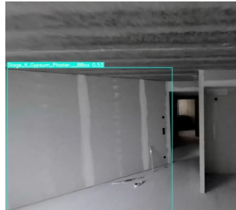
Figure 6: Prediction for Gypsum plastering