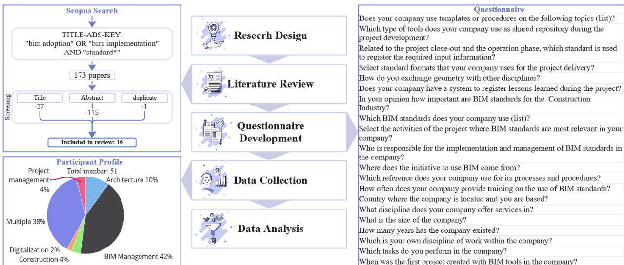
Figure 1 Methodology overview

Methodology overview is presented in Figure 1. This work aims to gain an insight into the use of BIM standards and concepts in Europe. A systematic literature review was first conducted using the Scopus database. The search was performed in Mai 2022 with the terms "bim adoption" or "bim implementation" and "standard*", and by searching through titles, keywords and abstracts. The search initially returned 173 documents. After the selection based on the title 37 documents were excluded. 115 papers were excluded based on the abstracts, which left 20 research papers. These were read and the content of 16 was deemed relevant. Their analysis is reported in the background section of this paper. The literature review