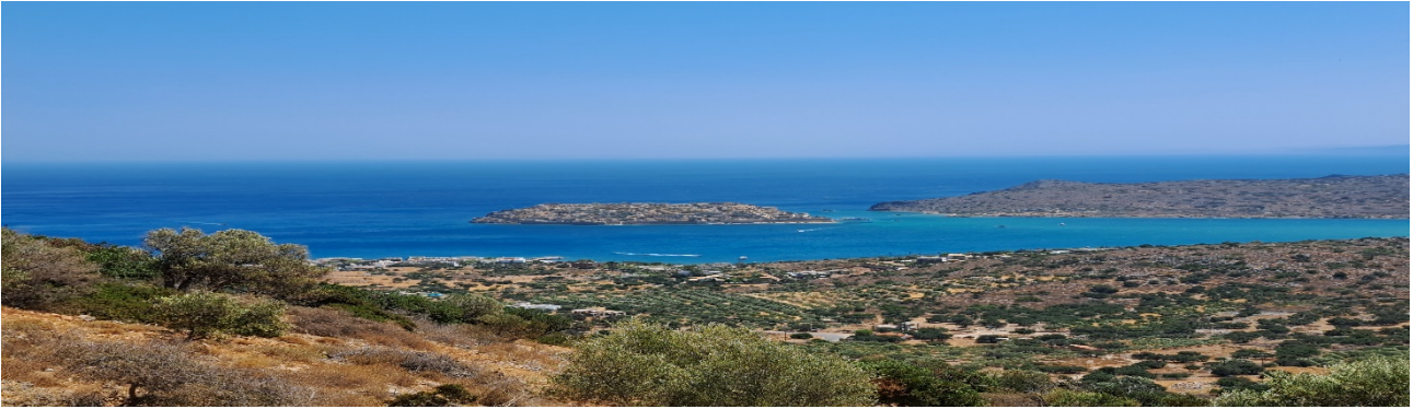
Figure 2: Example of a double width image

should be on the top of the table. The caption should be on the top of the table. Please include a 3-pt blank line above the figure and below the caption (formatting style “Small Space”). Tables should include borders at the top and bottom of the header row. Tables should include a border under the bottom row of the table. Tables should not include vertical borders (i.e. left and right borders).